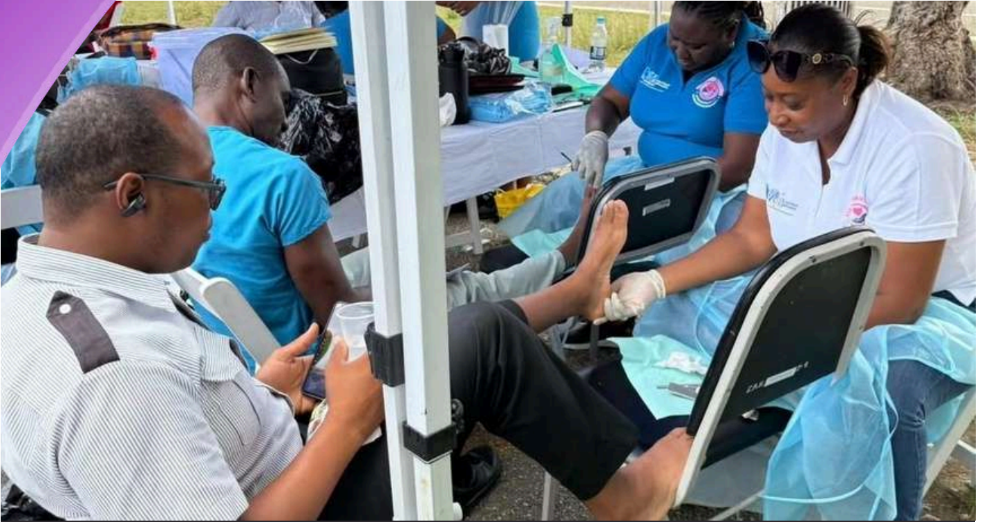
Staff at the Cornwall Regional Hospital receiving pedicures.

In celebration of Healthcare Workers Month, and as part of the ongoing commitment to promoting wellness, the Western Regional Health Authority hosted a successful, Men's Health Fair under the theme "Promoting Healthy Habits, Building Stronger Men". The health fair targeted male healthcare workers by providing health screenings and Wellness