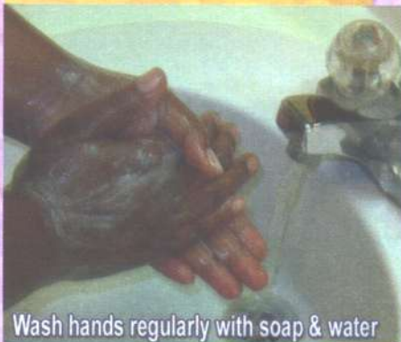
Wash hands regularly with soap & water

If you have traveled to or come into contact with someone from an affected country e.g. Mexico, Canada, UK or USA and have flu-like symptoms... contact your doctor or nearest Health Centre immediately.